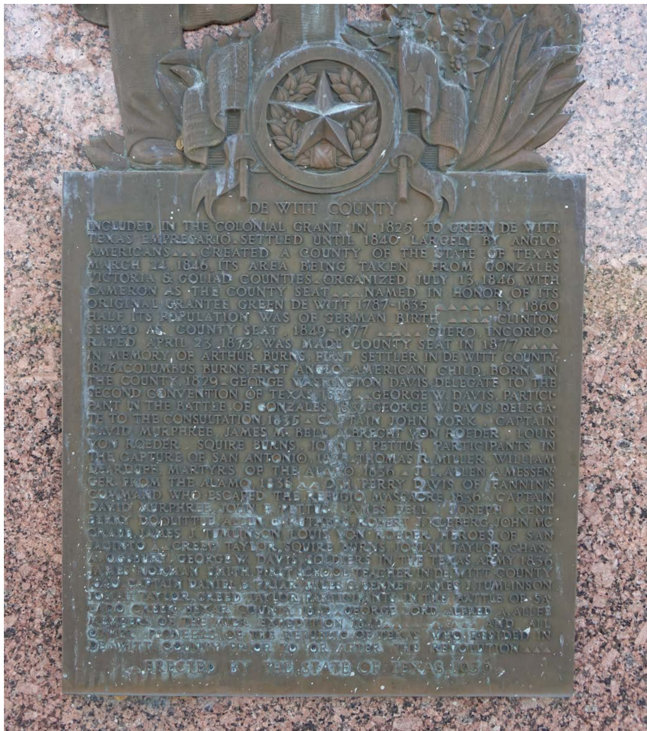
Photo 4: DeWitt County Monument plaque detail—camera facing west, February 16, 2018. The monument marker text outlines county history.