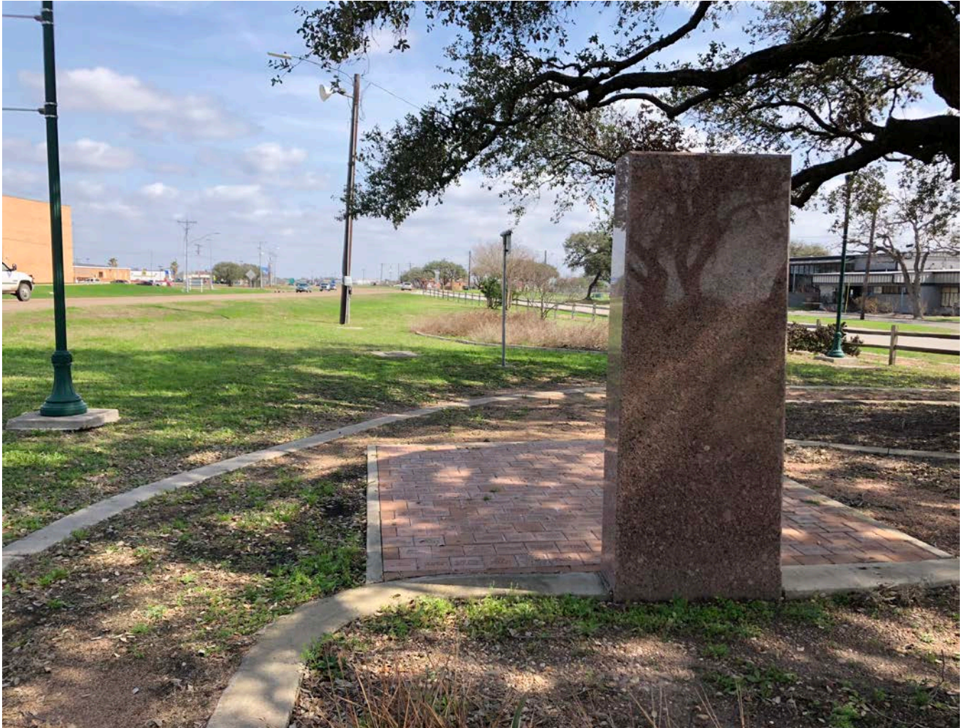
Photo 6: DeWitt County Monument back elevation—camera facing east, February 16, 2018. The monument was historically part of a landscape design plan implemented by the Texas Highway Department for roadside parks. Until 2012, a turnout between the highway junctions ran in front of the nominated property.