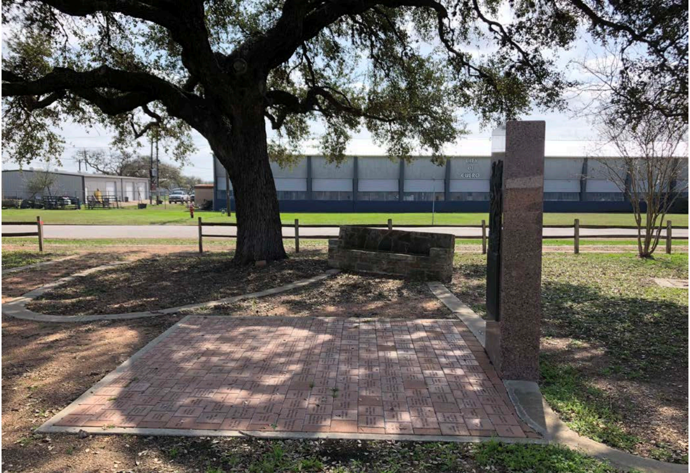
Photo 5: DeWitt County Monument side elevation—camera facing south, February 16, 2018.