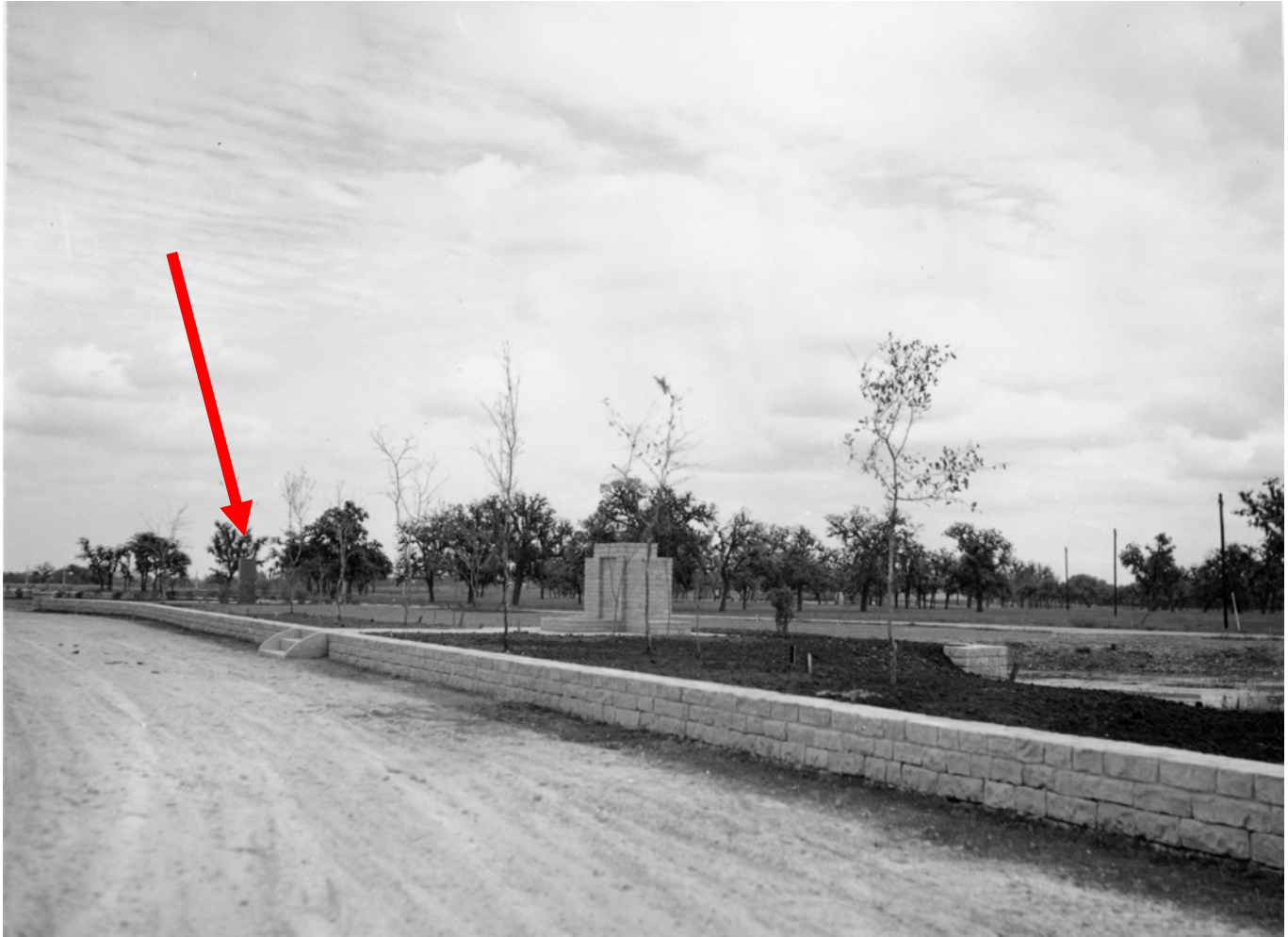
Figure 4: Looking southeast at the DeWitt County roadside park showing NYA-constructed retaining walls and fountain. Both features are currently intact, although Cueroans transformed the fountain into a statuary base circa 2010. The DeWitt Monument is in the background, indicated by the red arrow.