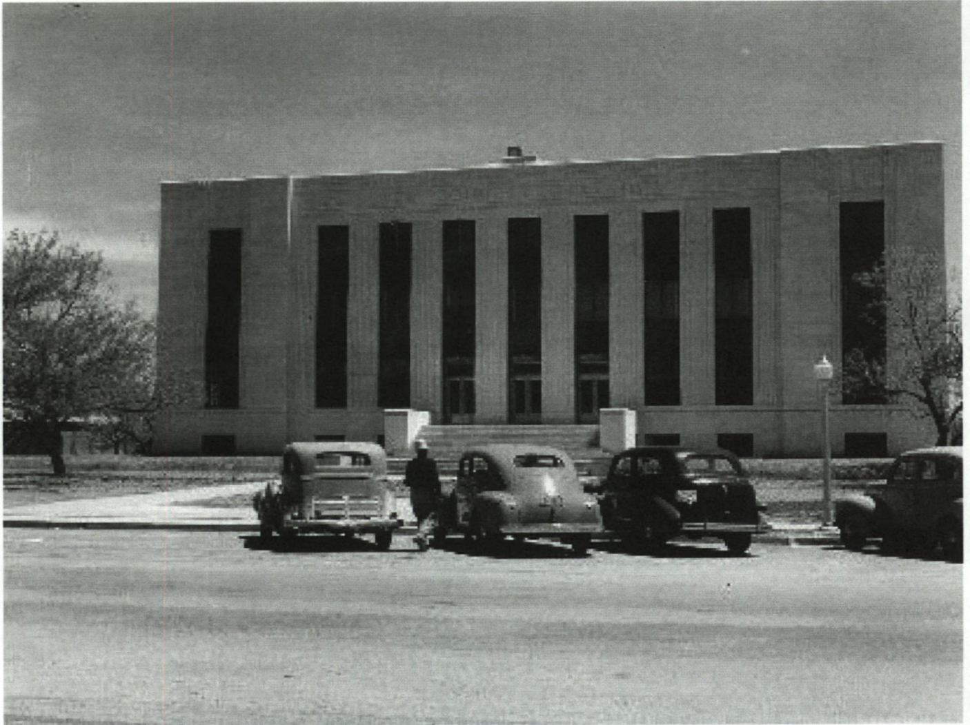
Jack County Courthouse, c. 1940